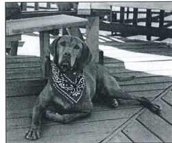
When Jack was not winning championships he enjoyed relaxing on the deck.

In 1996, the Eastern Vizsla Classic became a Championship for the first time, and once again Jack showed his dominance by capturing this Championship. The 1996 NVA National Championship had moved to the Flint Hills near Eureka, Kansas. Jack showed he was a great competitor with a proven ability to adapt to the course before him to win the Championship. Jack